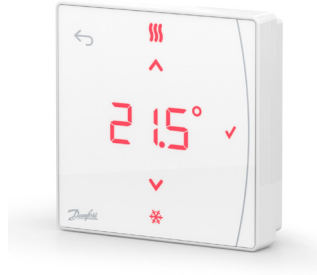
Danfoss Icon2™ RT 088U2121