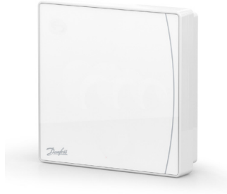
Danfoss Icon2™ Sensor 088U2120