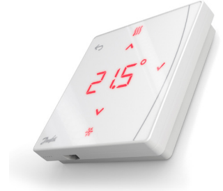
Danfoss Icon2™ Featured RT (IR sensor) 088U2122

Danfoss Icon2™ RT is a series of wireless thermostats that offers the freedom to place your thermostat without the constraints of wires in the wall. The fade away feature, together with the minimalistic design, only 16 mm deep, gives it elegance and makes it blend in with the surroundings.